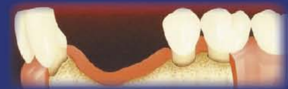
Figure 3: Bone loss over time after teeth are extracted

When patients lose their teeth ( Figure 2 ), the jawbone resorbs which results in the decreased bone height and shrinkage of gum tissue ( Figure 3 ).