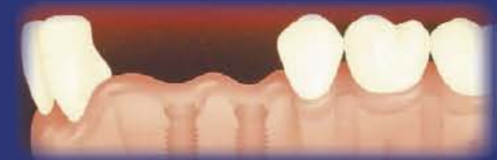
Figure 2: Extraction Site

Loose-fitting dentures cause a variety of problems with appearance, eating, speaking, and can be uncomfortable. A dental implant is a titanium structure placed into the jawbone by your Oral and Maxillofacial Surgeon ( Figure 1 ). Special attachments hold the denture to the implants securely.