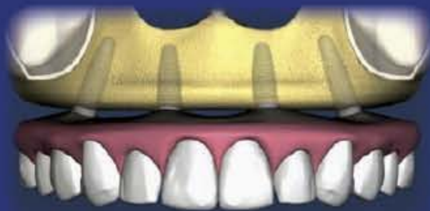
Figure 4: Implant-Retained Upper Denture

A temporary denture can be worn over the implants for 2-3 months while the implants fuse to the bone. This allows patients to have teeth and resume daily activities while healing takes place. A permanent denture can then be made by your general dentist ( Figure 4 ).